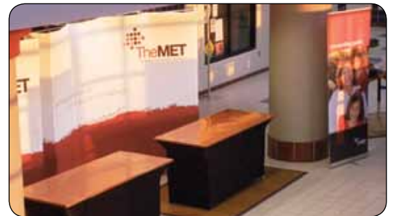
Portable welcome center.

Want to see a Portable Church in action?