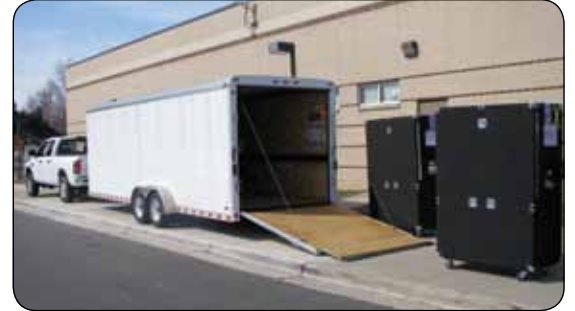
Open trailer unloading rolling cases.