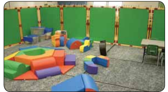
Play panel toddler classroom.